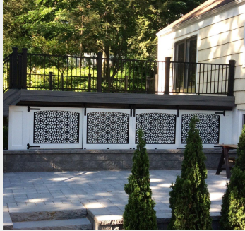
Custom Skirting Around Deck Perimeter