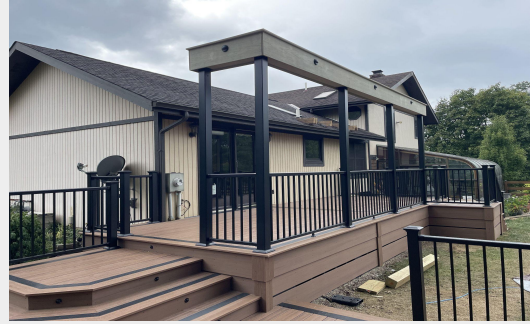
Shade Beams and Varied Width Skirting