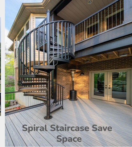
Spiral Staircase Save Space