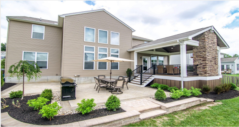
Whole Backyard Makeover Project (PICTURED LEFT)