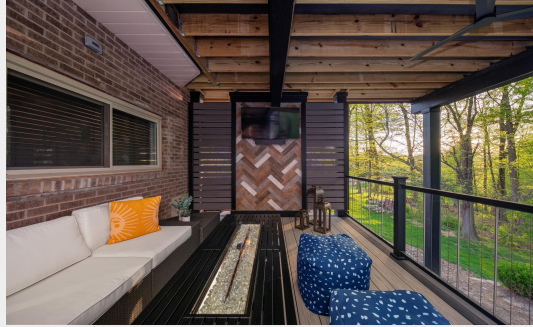
Custom TV/Privacy Walls