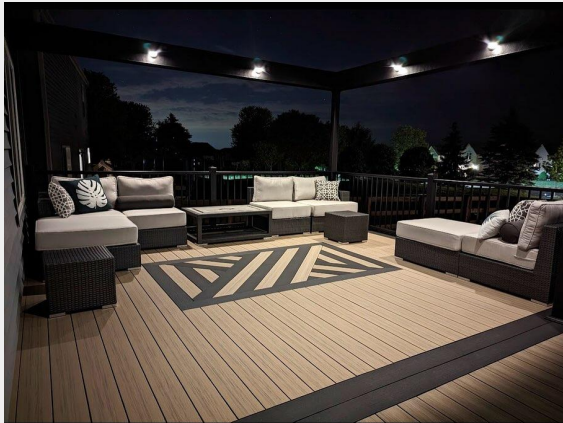
Open Air Shade Beam w/Lighting, Custom Composite Inlay and Privacy Wall (Same deck shown in evening/daytime)